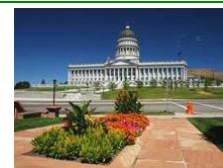
Salt Lake Capitol

Our tour comes to an end. Journey home or continue traveling.