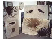
Fossil Butte N.M.

Optional fish fossil hunting tour, view Ulrich’s Fish Fossil Gallery. Stop at Park’s City famous Outlet Mall for some brand name shopping. Visit 2002 Winter Olympics Park, Alf Engen Ski Museum. Evening and 2 nights in Salt Lake City.