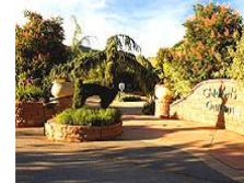
Red Butte Gardens

Visit Utah’s grandiose capitol building, then explore Red Butte Botanical Gardens, where rare birds, rabbits, lizards and other animals reside. Afternoon hiking and picnicking at Antelope Island State Park, habitat for North American wildlife including Pronghorn Antelopes and bison. Optional swim in Salt Lake. Say good-bye at dinner in Salt Lake City.