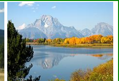
Teton National Park