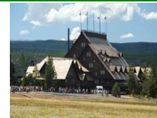
Old Faithful Inn

Drive through Yellowstone National Park exploring more famous wonders. Onto Grand Teton National Park, picnic, hike along beautiful Jenny Lake and take a leisure boat ride. Look out for moose. Explore Jackson with its art galleries and gift shops. Night in a lodge on Snake River in the small community of Alpine.