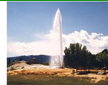
Lava Hot Springs

View wild birds at Blackfoot Reservoir habitat of American White Pelicans and/or depending on the season Grays Lake National Wildlife Refuge with rare Sandhill Cranes and trumpeter swans. Explore Fossil Butte National Monument. See rare fossils of fish, leaves, turtles and more amid wildlife viewing. Night in Kemmerer.