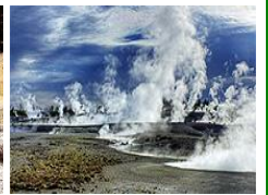
Norris Geyser Basin