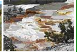
Mammoth Hot Springs