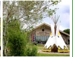
Buffalo Bill Center