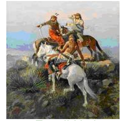
Favell Native Art Museum