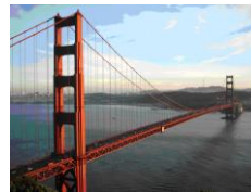
Golden Gate Bridge

Leave early morning for a last day of adventures. Enjoy the scenic drive along deep blue Lake Shasta. Discover California's farmland with stops at the olive and fruit stands and get a taste of the highest quality olives. Travel through lovely wine country near Napa and Sonoma, a historically rich city with famous plaza, a remnant of the Mexican colonial past. Say good-bye at dinner in Sausalito with beautiful views of the skyline of San Francisco. Walk to a view point of Golden Gate Bridge and end the day in downtown San Francisco for the night.