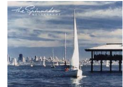
San Francisco view from Sausalito