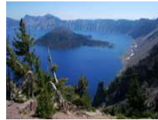
Crater Lake National Park

Trip to famous Crater Lake National Park. Crater Lake is the deepest lake in the U.S. Its stunning blue water and peaceful setting provides a lasting impression on each visitor. Short hike along Crater Lake's rim. Drive along the Volcanic Legacy Scenic Byway passing the wonderful Klamath Lake. Stop at the Fort Klamath Visitor Center. Crossing the border to California continue to majestic 12000 feet high volcano Mt. Shasta. Night in Shasta City.