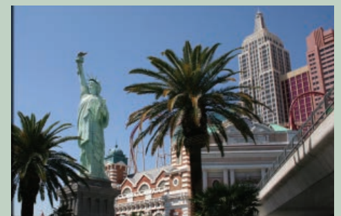
Las Vegas Strip