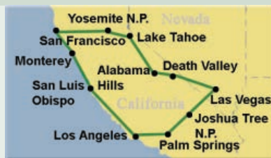
California Treasures Route

Experience the unbelievable contrast between nature and culture as we travel through the heart of America's most beautiful state, California. See the lights, entertainment and shopping of San Francisco and Los Angeles. Alternately, explore along Monterey's and Big Sur's quite beaches, left untouched. See the natural splendor of famous national parks, from lush fields of flowers in Yosemite to unusually barren salt flats in Death Valley. Join us as we journey through the grandest highlights of this beautiful state.