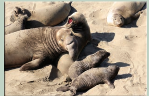
Elephant Seals by San Simeon

Shopping, galleries, romantic harbors, Hollywood Star Walk, Universal Studios, Las Vegas gambling and shows, and more greet you in America's upbeat western cities. In contrast, we spend most of our time walking in the West's most scenic natural areas, with vast expanses of protected land at Joshua Tree and Death Valley National Parks, as well as along the ocean. After taking a wild carnival ride or watching a performance in L.A., spend a night relaxing in a hot tub at one of our choice hotels. Or maybe you want an optional whale watching tour, before perfecting a picture of wildflowers in front of a beach where you can walk peacefully until the sun sets. Let us take you there, we'll worry about details, while you enjoy this amazing state.