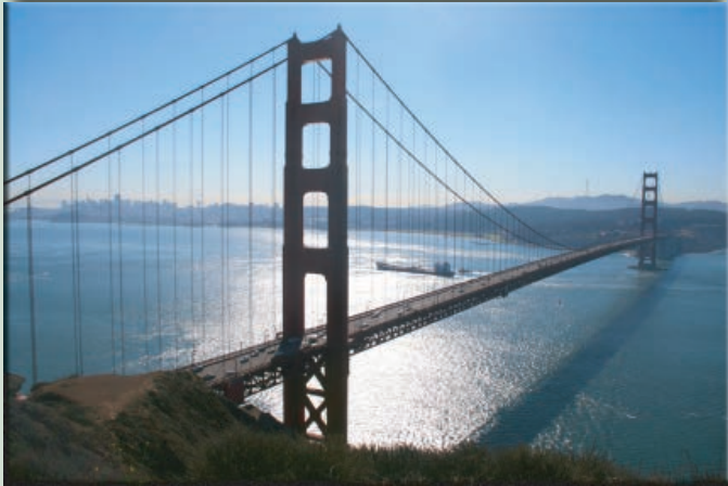
Golden Gate Bridge, San Francisco Skyline in Background