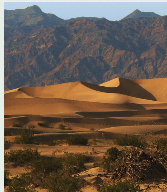
Death Valley National Park, Dunes

Day 14: Journey home or continue travel on your own.