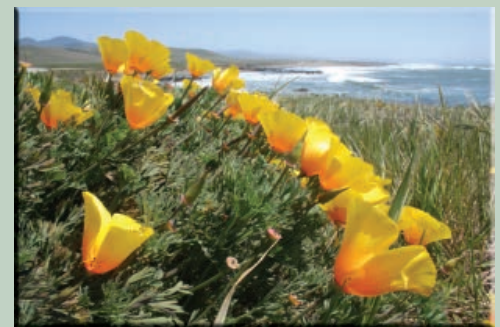
Big Sur Coastline